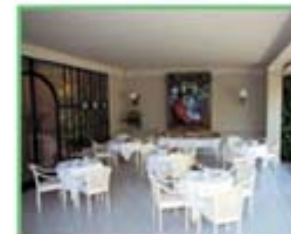
veranda and garden

Located in the town center of Forte dei Marmi, close to the most famous shops and to the beautiful fine sands of the beach, Hotel Goya offers to our guests first-class hospitality in a liberty-style building embellished by precious marbles and ancient furnitures.