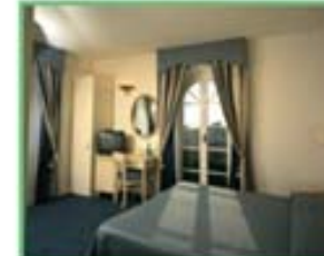
47 rooms and 4 suites