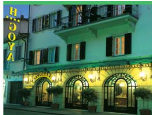
FORTE DEI MARMI

Via Carducci, 69 - 55042 Forte dei Marmi - Italy Tel. +39 0584-787221 - Fax +39 0584-787269 Casella postale 191 Email: info@hotelgoya.it www.hotelgoya.it